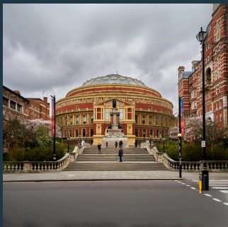
Royal Albert Hall