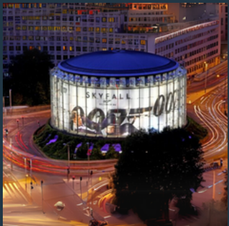
IMAX - Southbank