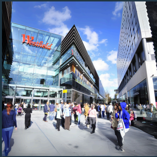
Westfield - Stratford