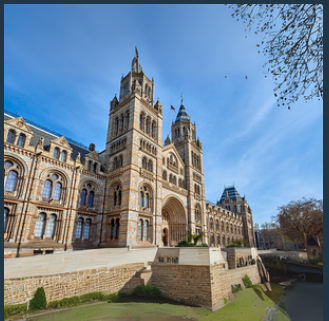
Natural History Museum